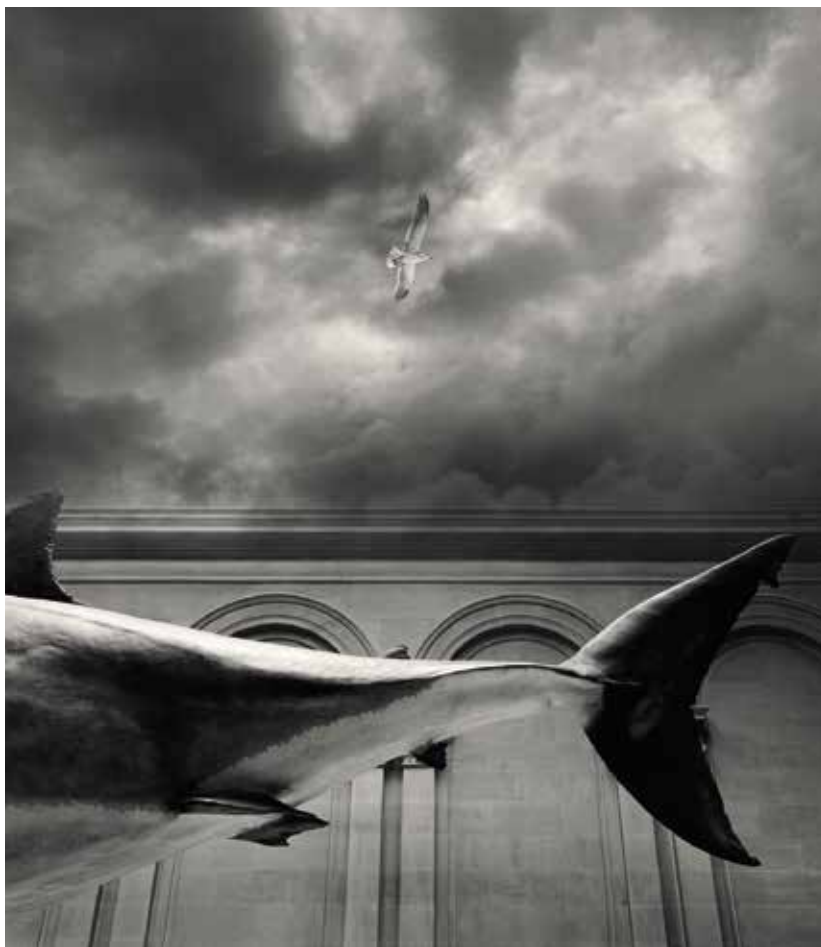
Untitled, 1983, by Jerry Uelsmann